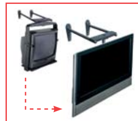
Double Jumbo Wall Arm