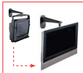
Single Jumbo Wall Arm