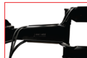
U-Groove covers provide 1" clearance for cables