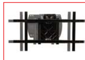
7.75" of horizontal adjustment