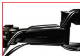
U-Groove covers provide 1" clearance for cables