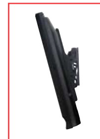
Adjustable +15/-5° tilt