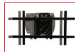
7.75" of horizontal adjustment