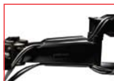
U-Groove covers provide 1" clearance for cables