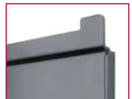
Specially designed safety tabs for secure support