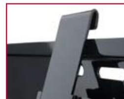
Easy hook-on design