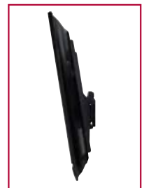
Adjustable +15/-5° tilt